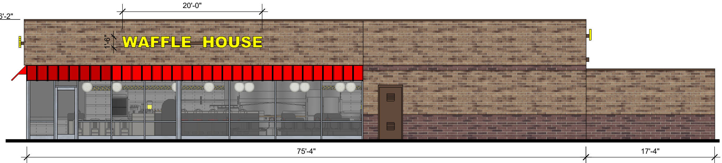
LONG GLASS WALL SCALE: 1/8" = 1'-0"