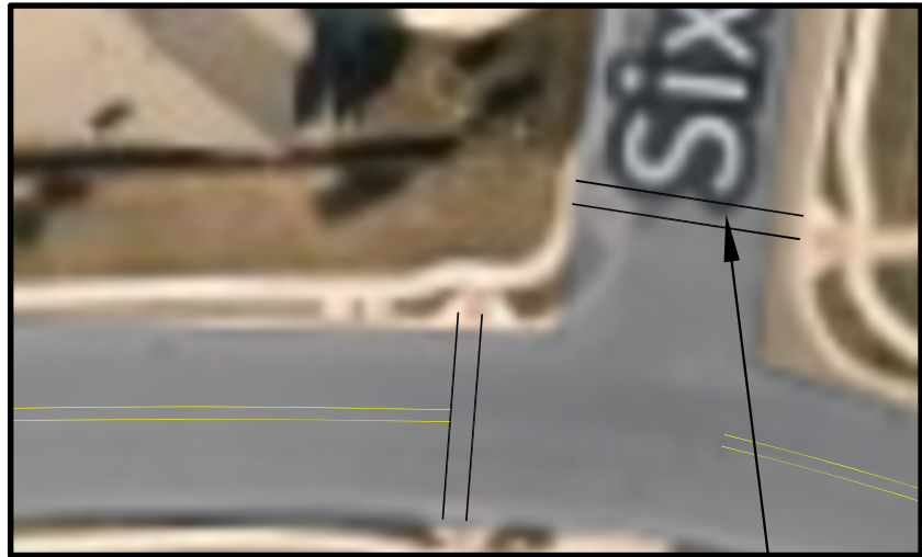
12" SOLID WHITE PEDESTRIAN CROSSING TYP.