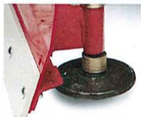
Adjustable cast iron skid shoe discs