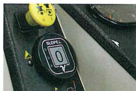
Digital Slope Gauge Recommended for operation on slopes.

*Attachments, accessories, and tire configuration may reduce the 4500 power unit's maximum angle of operation. Refer to applicable operator manuals for maximum angle of operation of equipment.