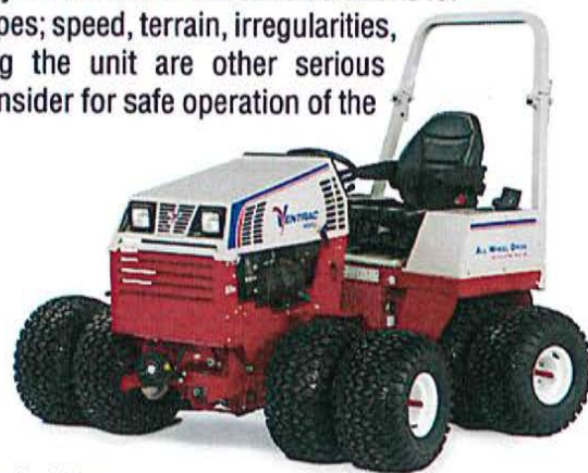
Shown with Standard Tires

Duals are only one of numerous considerations for safety on slopes; speed, terrain, irregularities, and stopping the unit are other serious factors to consider for safe operation of the tractor.