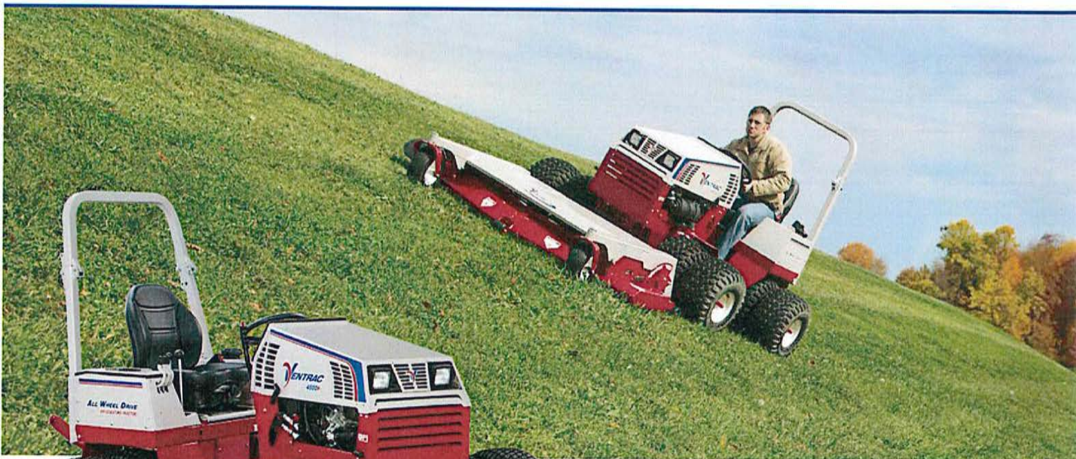
Shown with Turf Tires