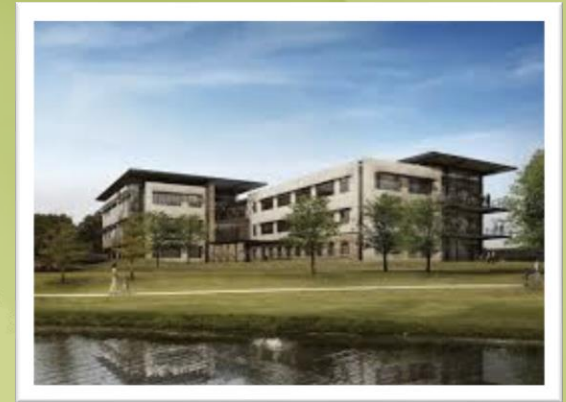
Plano, TX Headquarters