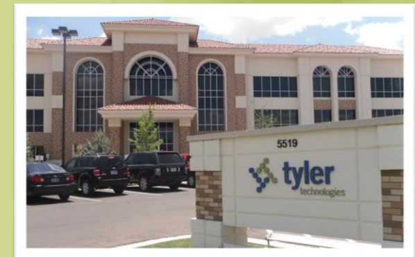
Lubbock, TX Office